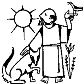
Francis of Assisi

Animals fill the skies, the earth and the seas. They are God's beloved creatures. St. Frances remember this. He called the animals his brothers and sisters. Today we ask God to bless these animals, our brothers and sisters. We thank God for letting us share the earth with such wonderful and amazing creatures.